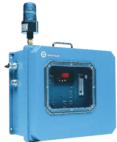
LD Series Single Point Monitor