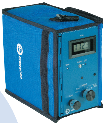
4000 Series "Compact" Portable