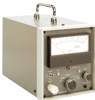
1000 Series "Standard" Portable