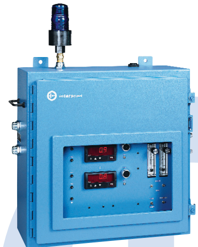
LD Series Two Point Monitor